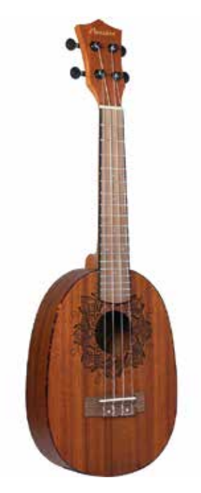
PRANA SOPRANO AND CONCERT