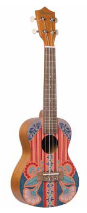
VINTAGE SOPRANO AND CONCERT

Let's get inspired by our dreams and their potential to transform us day by day with this ukulele line.