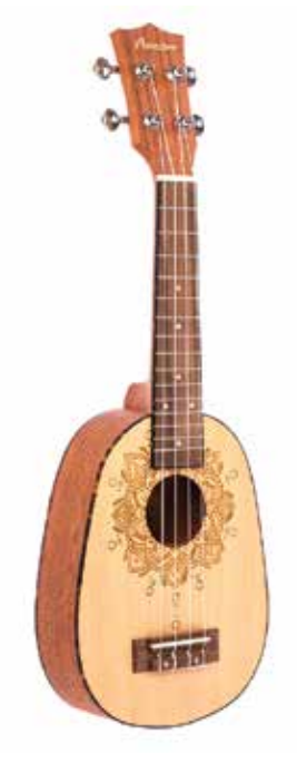
HONOLULU SOPRANO AND CONCERT

This line is known for their engraved designs, seeking to delve into details, enjoying pretty little things and being able to express ourselves through the most representative symbols of our Earth.