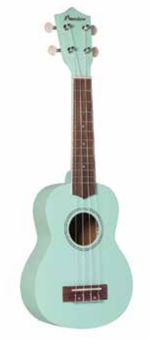
LIGHT GREEN SOPRANO AND CONCERT