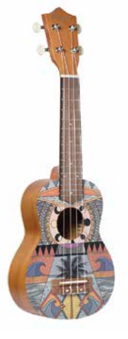
ECLIPSE Soprano and concert