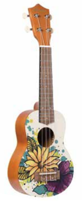
SPRING Soprano and concert

Everything that happens in nature has a deep impact on us. To flourish is to externalize the growth that happens within us, it is to feel free, live in the present, paint our lives with colors and fill ourselves with energy.