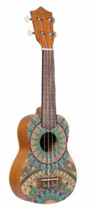
FRESH AQUA SOPRANO AND CONCERT