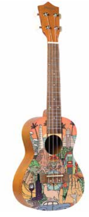
LATIN SOPRANO AND CONCERT