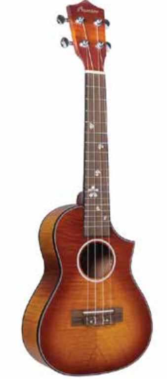
BLOSSOM SUNBURST SOPRANO, CONCERT AND TENOR