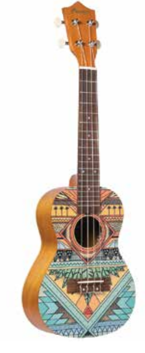
PAMPA Soprano and concert