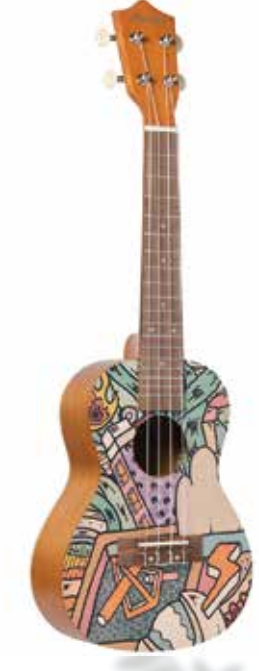
MAGIC CITY Soprano and concert