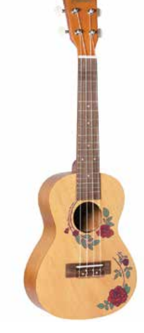
ROSES Soprano and concert