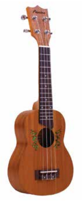
IRIS SOPRANO AND CONCERT