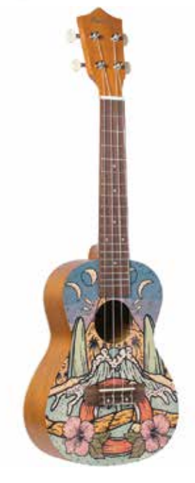
COOL BEACH Soprano and concert

Nature is the perfect place to share music with other people. Inspired by the warmth of the sun and the connection with the horizon, the designs in this series join the sound of music with the movement of the waves, the sea, the mountains and their curves or the forests and their grandeur.