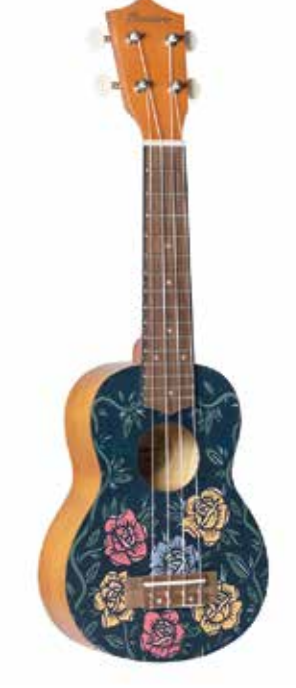
AURORA Soprano and concert