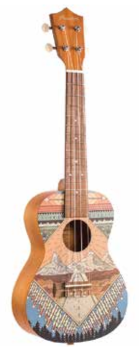
PATAGONIA Soprano and concert

We live in a world with rich cultural diversity and with this line, we seek to celebrate and reflect the essence of emblematic places and heritages around the world. Each design has features and art that invites you to connect with a culturally diverse part of our world.