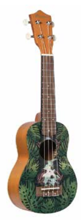
WATERFALL SOPRANO AND CONCERT