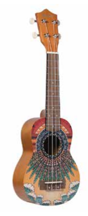
SUNSHINE SOPRANO AND CONCERT