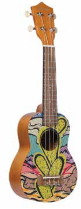
CACTUS Soprano and concert