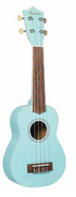
LIGHT BLUE SOPRANO AND CONCERT