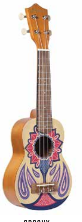
GROOVY Soprano and concert