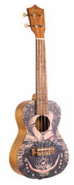
FREEDOM SOPRANO AND CONCERT