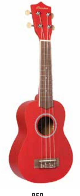
RED SOPRANO AND CONCERT