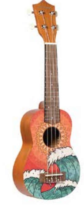
ORANGE WAVE Soprano and concert