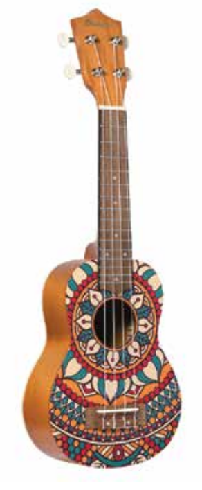
CIRCUS Soprano and concert