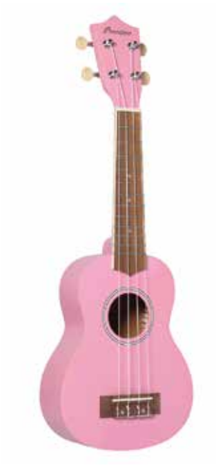
LIGHT PINK Soprano and concert