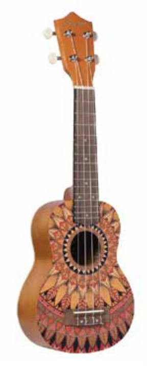
SUMMER Soprano and concert