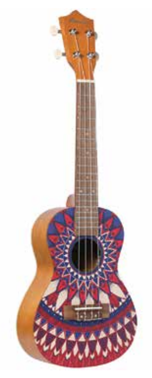
PASSION SOPRANO AND CONCERT