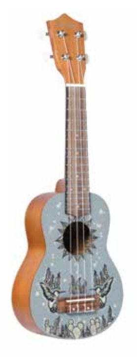
SKY Soprano and concert