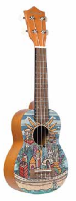
BUENOS AIRES Soprano and concert