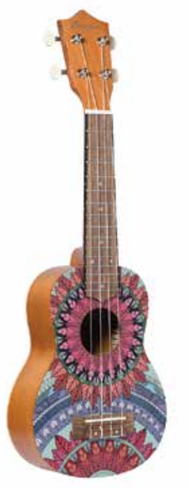
NEW HOPE Soprano and concert