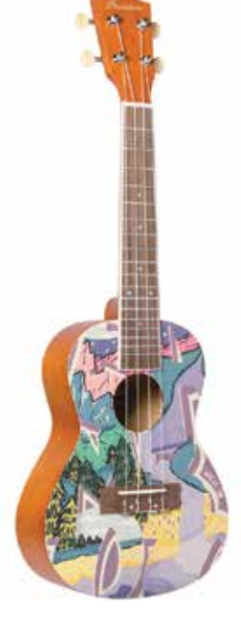
CANDY BAMBOO Soprano and concert