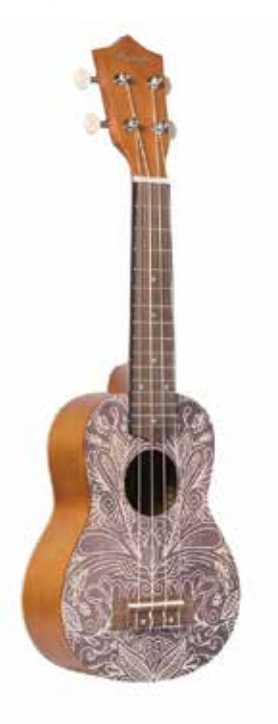
ELIXIR Soprano and concert