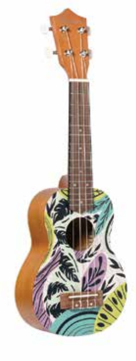
BEAUTY SOPRANO AND CONCERT