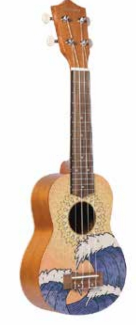
WAVE SOPRANO AND CONCERT