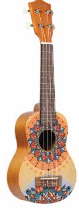
THE SHINE SOPRANO AND CONCERT