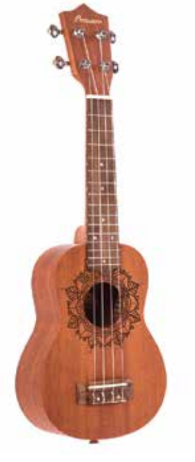
KAILUA SOPRANO AND CONCERT